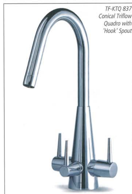
TF-KTQ 837 Conical Triflow Quadro with 'Hook' Spout