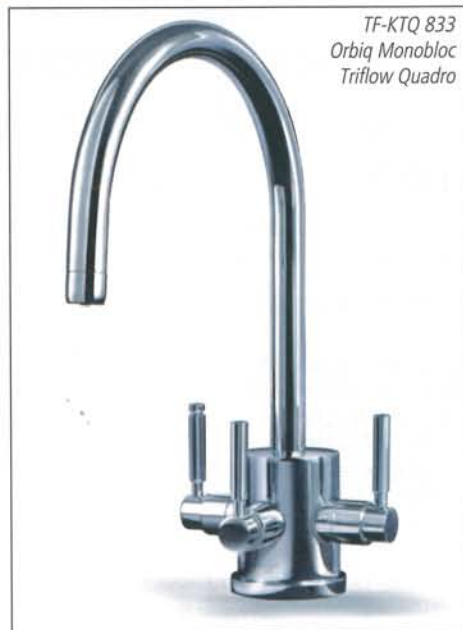
TF-KTQ 833 Orbig Monobloc Triflow Quadro

► 0207 079 0541 ► www.triflowconcepts.com