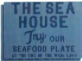
▲ A taste of the seaside. Place mats , £2.50 set of two, H&M, 0844 736 9000, shop.hm.com.