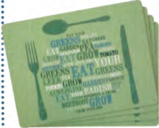
▲ Good advice. Eat Your Greens , £15 set of four, Laura Ashley, 0871 983 5999, lauraashley.com.