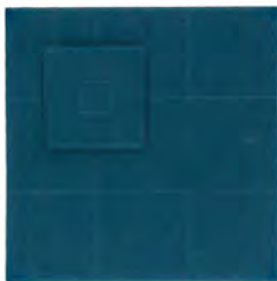
▲ Great value. Eight-piece mat and coaster set in Soft Teal , £13, Very, 0844 822 2321, very.co.uk.