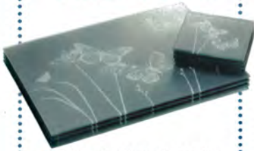
▲ Glass design. Butterfly , £12 set of four, Marks & Spencer, 0845 302 1234, marksandspencer.com.