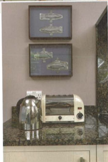
▲ All the accessories in Roger and Robert's kitchen were carefully considered before purchase, such as this Dualit four-slice toaster and Phillips kettle

If you are stuck for splashback ideas consider continuing the worktop like Roger and Robert have done. Hardwearing marble makes a heat-resistant, durable and easy to clean splashback.